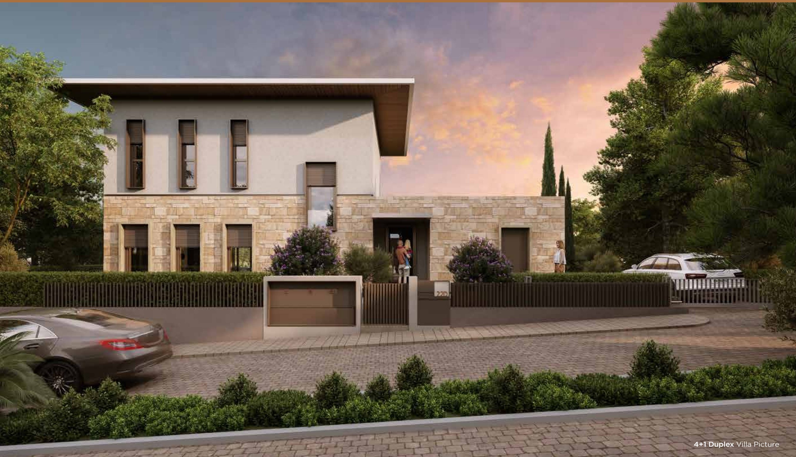
4+1 Duplex Villa Picture