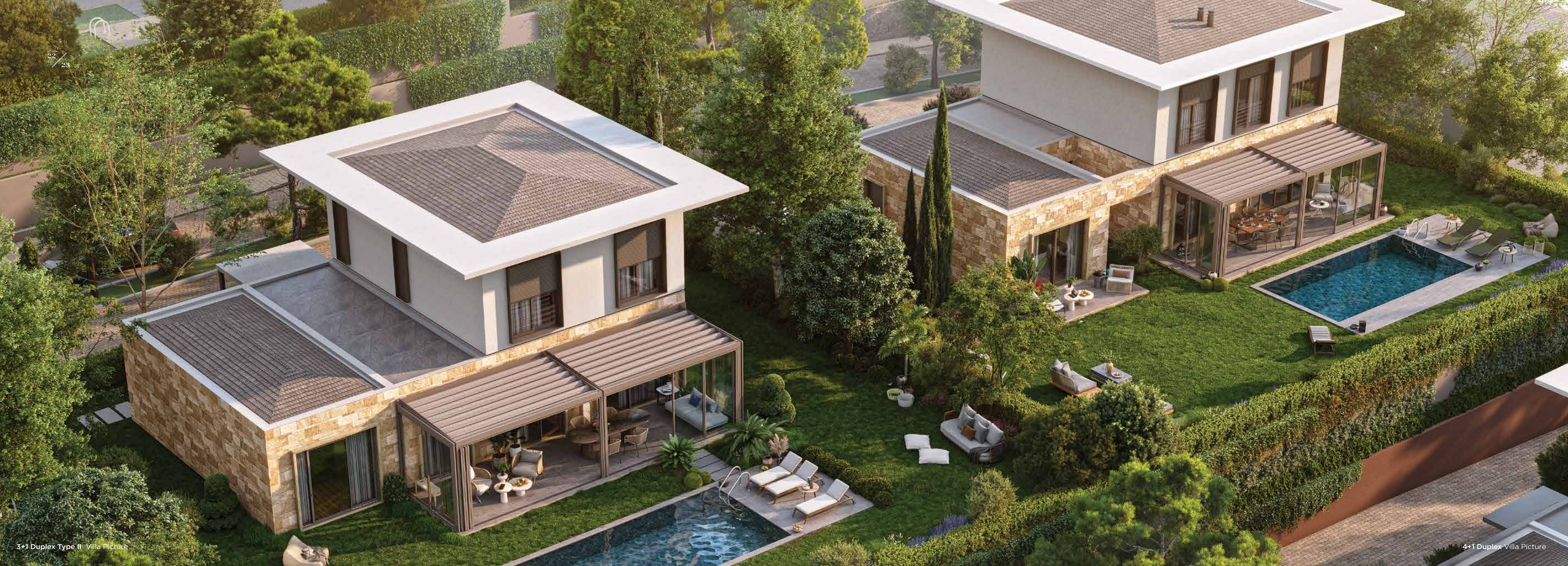
3+1 Duplex Type II Villa Picture