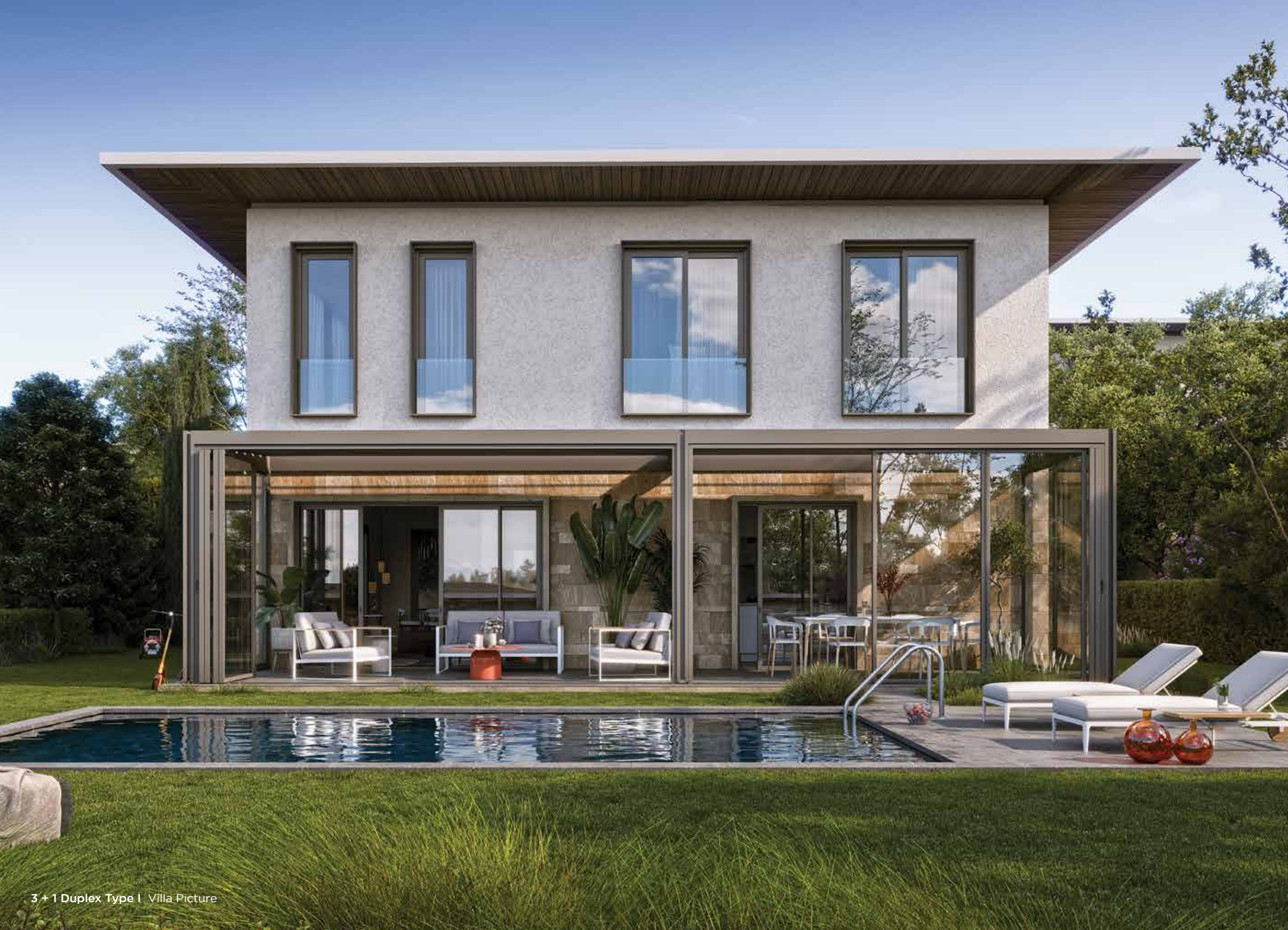
3 + 1 Duplex Type I Villa Picture