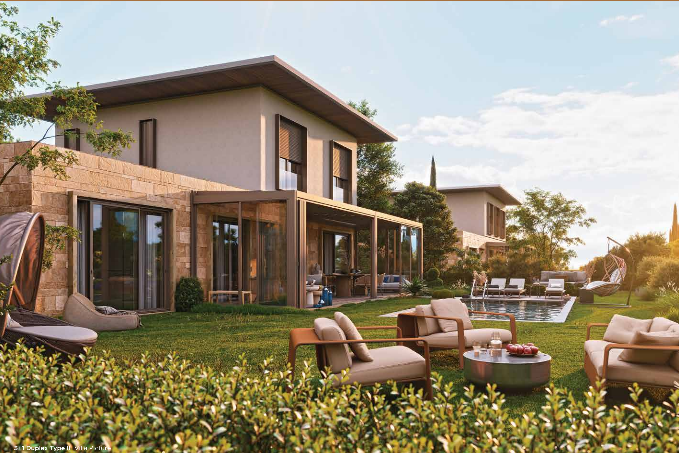
3+1 Duplex Type II Villa Picture