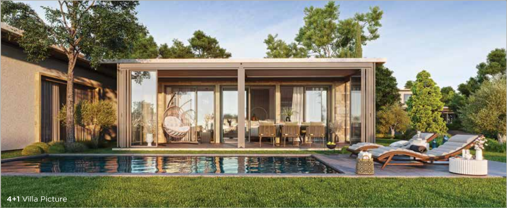
4+1 Villa Picture