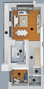
Duplex First Floor Plan