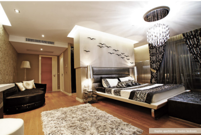
Duplex apartment - master bedroom