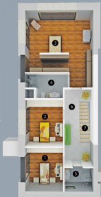
Duplex Second Floor Plan

OVERALL GROSS AREAS INCLUDE CIRCULATION AREAS AND PRIVATE STORAGE SPACES IN THE BASEMENT.