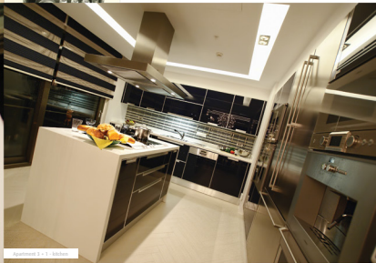
Apartment 3 + 1 - kitchen