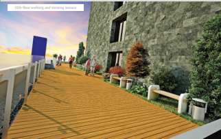
10th floor walking and viewing terrace

At Folkart Mavişahit, the peaceful touch of water will take away all the stress of the day.