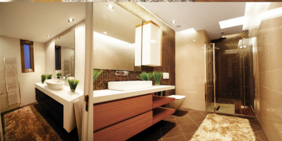
Duplex apartment - bathroom