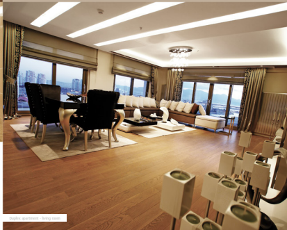
Duplex apartment - living area