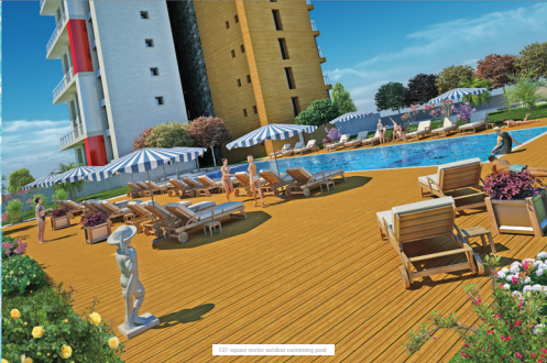
127 square meter outdoor swimming pool

At Folkart Mavişahit, the peaceful touch of water will take away all the stress of the day.