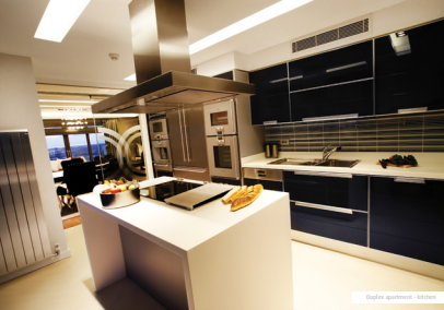
Duplex apartment - kitchen